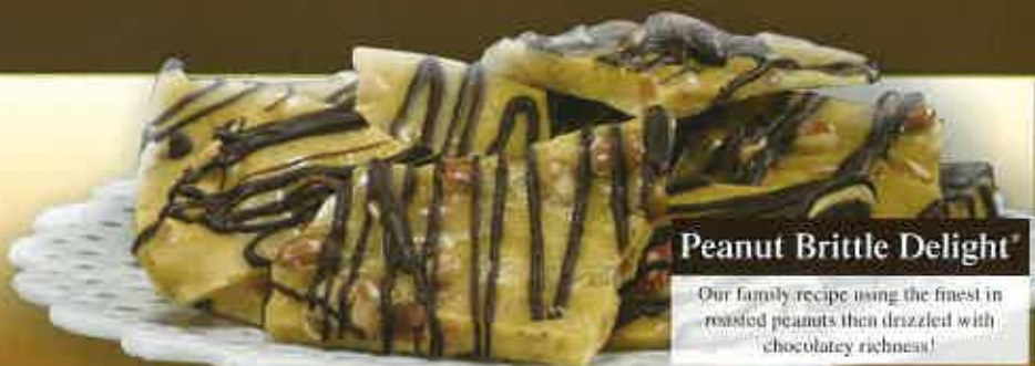
Peanut Brittle Delight®

Our latest creation! Hand crafted by our chocolatiers using only the finest ingredients and no preservatives. Simply decadent!