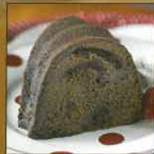
Double Chocolate Raspberry