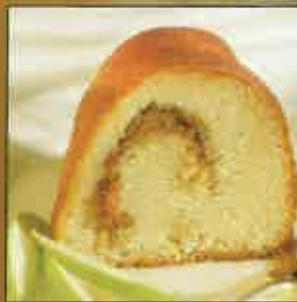
Apple Maple Walnut