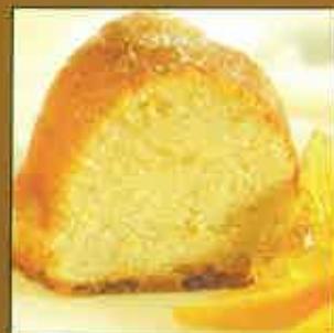
Honey Orange Poppy