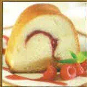
White Chocolate Raspberry